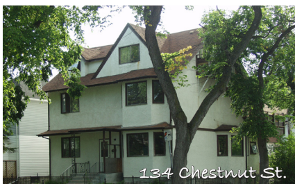
134 Chestnut St.