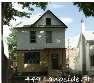
449 Langside St.