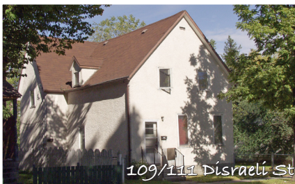
109/111 Disraeli St.