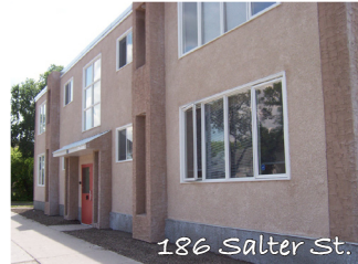
186 Salter St.

290 Langside - WHRC renovated a vacant apartment building for $495,000.