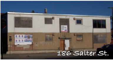
186 Salter St.

186 Salter St. - WHRC purchased and made extensive renovations to a vacant and boarded up four-plex consisting of four, two-bedroom units at 186 Salter Street in William Whyte. Exterior work included the installation of a parking lot, fencing and landscaping.