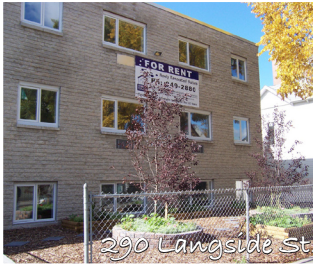
290 Langside St.

290 Langside - WHRC renovated a vacant apartment building for $495,000.