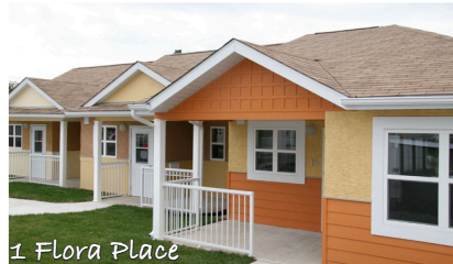
1 Flora Place